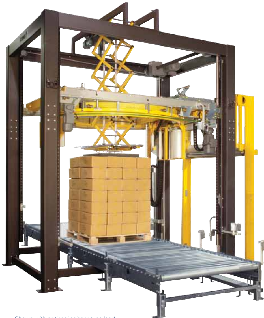
Shown with optional scissor type load stabilizer and integral top sheet dispenser

Heavy duty steel frame structure along with a well balanced ring and belted lifting device results in quiet, efficient performance and minimal maintenance