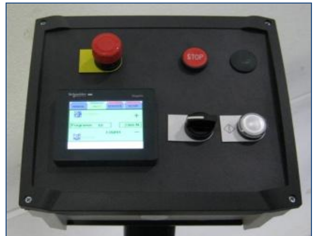
Easy to use HMI machine programme display unit for MH based machines to make machine adjustments without the need for technical skills or any PLC programming devices.