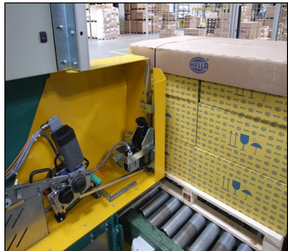
Side mounted MH-Modular system for pallets in a VRB pallet strapping machine securing parts cartons on a pallet with 9-12mm PP or PET strap