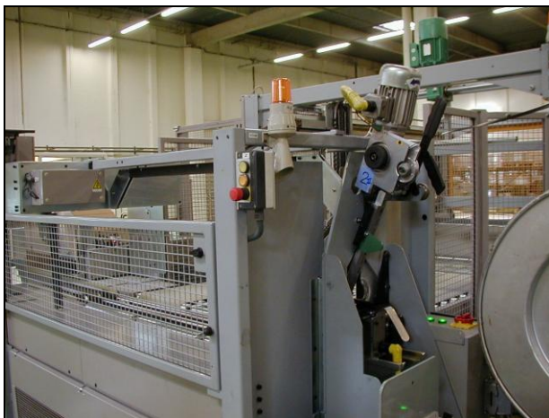
MHC-Module Feed and Sealer units weigh 10-12 kg only so can, as here in a graphics application, be easily removed for service needs