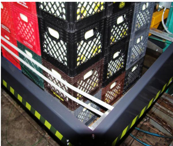
Note the flexible strap guide arms to ensure strap is applied horizontally even to irregular sized loads