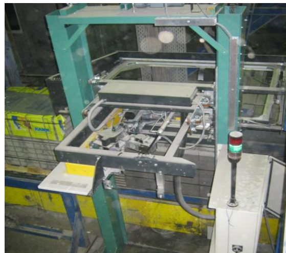
MH-H applying PET strapping to 40 mm concrete pavers, up to four straps per load 40-60 loads/hour