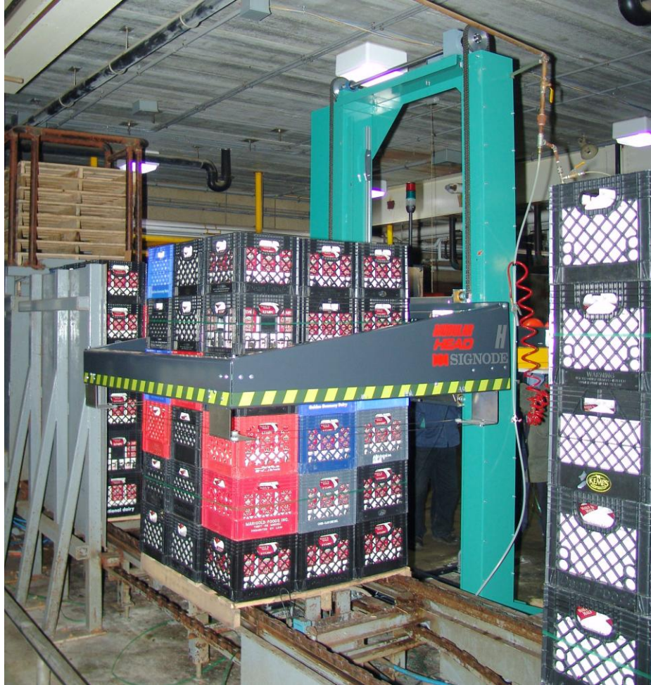
Model shown installed in a food processing plant for horizontal strapping of crates on pallets The variable strap tension ensures products are secured correctly without damage to the crates