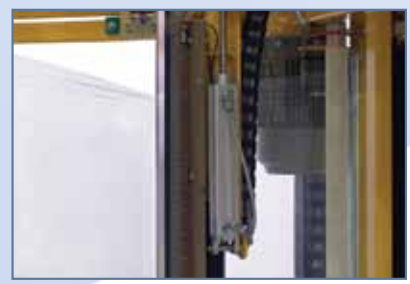
2. No Touch-No Tail (NT2) - The counter plate heat sealing device with maintenance free film cutting element ensures that the film is consistently sealed with no tail to provide a perfectly finished wrap.