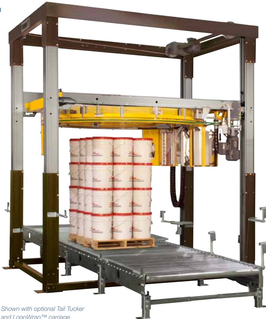
Shown with optional Tail Tucker and LogoWrap™ carriage.

Durable aluminum frame structure with a well-balanced ring and lifting belts results in quiet, efficient performance and minimal maintenance