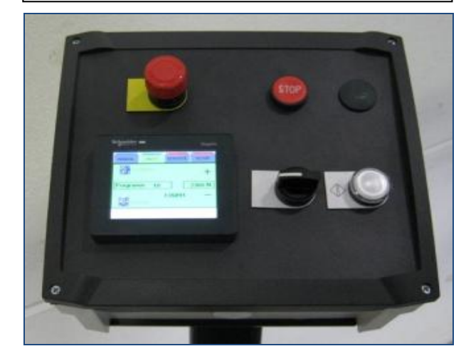
Easy to use HMI machine programme display unit for MH based machines to make machine adjustments without the need for technical skills or any PLC programming devices.

The company reserves the right to make technical changes without prior notification