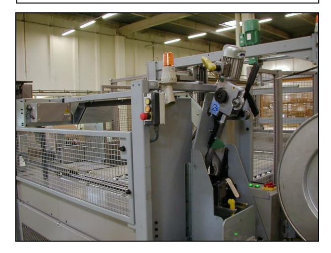
MHC-Module Feed and Sealer units weigh 10-12 kg only so can, as here in a graphics application, be easily removed for service needs