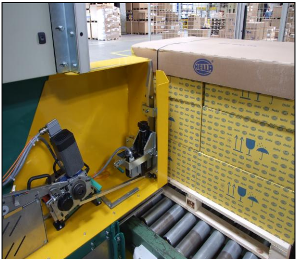
Side mounted MH-Modular system for pallets in a VRB pallet strapping machine securing parts cartons on a pallet with 9-12mm PP or PET strap